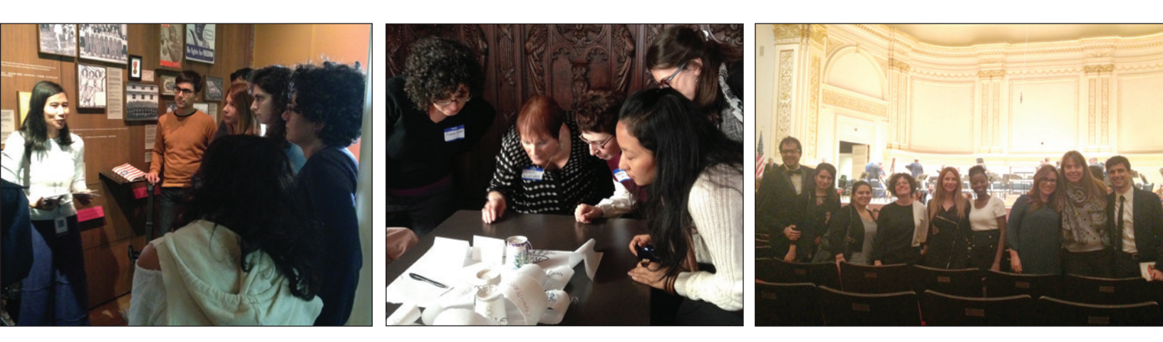
(Left) Tour of the Museum of Chinese in America. (Center) Workshop with Facing History and Ourselves and the Auschwitz Institute that took place at the National Museum of the American Indian in New York. (Right) Group outing to listen to the Belgrade Philharmonic's performance at Carnegie Hall.