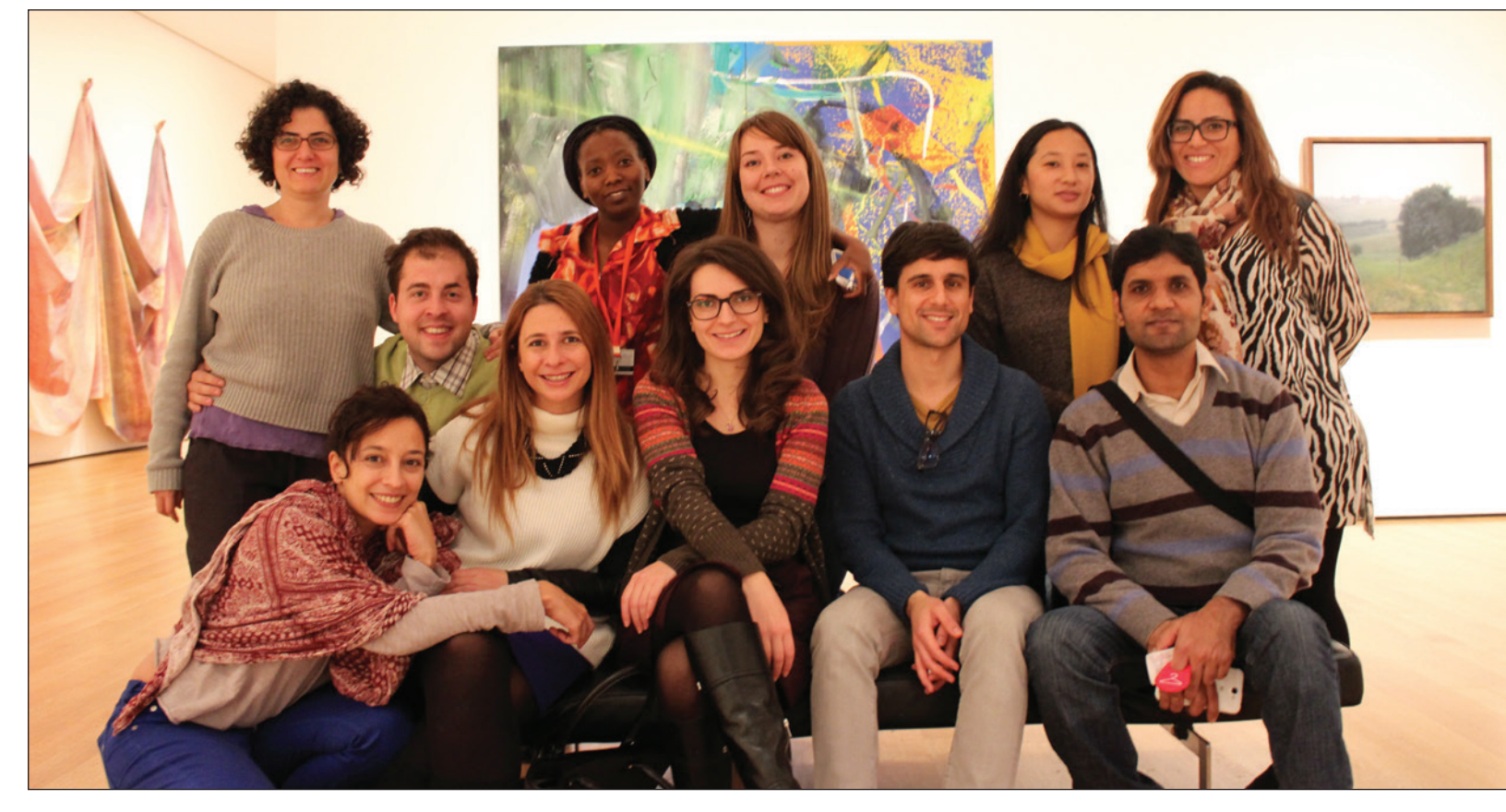
The AHDA fellows at the Museum of Modern Art.

The AHDA curriculum includes four types of sessions: seminars with scholars and other experts in historical dialogue, exploring major theoretical issues and on-the-ground case studies; capacity building workshops that focus on practical skills important to the work of historical dialogue site visits to relevant organizations working in historical dialogue, to observe their practices, learn more about their strategies, and meet their leadership and staff; finally, fellows have the opportunity to enroll in one to two Columbia University courses of their choice, relevant to their particular context or approach to historical dialogue.