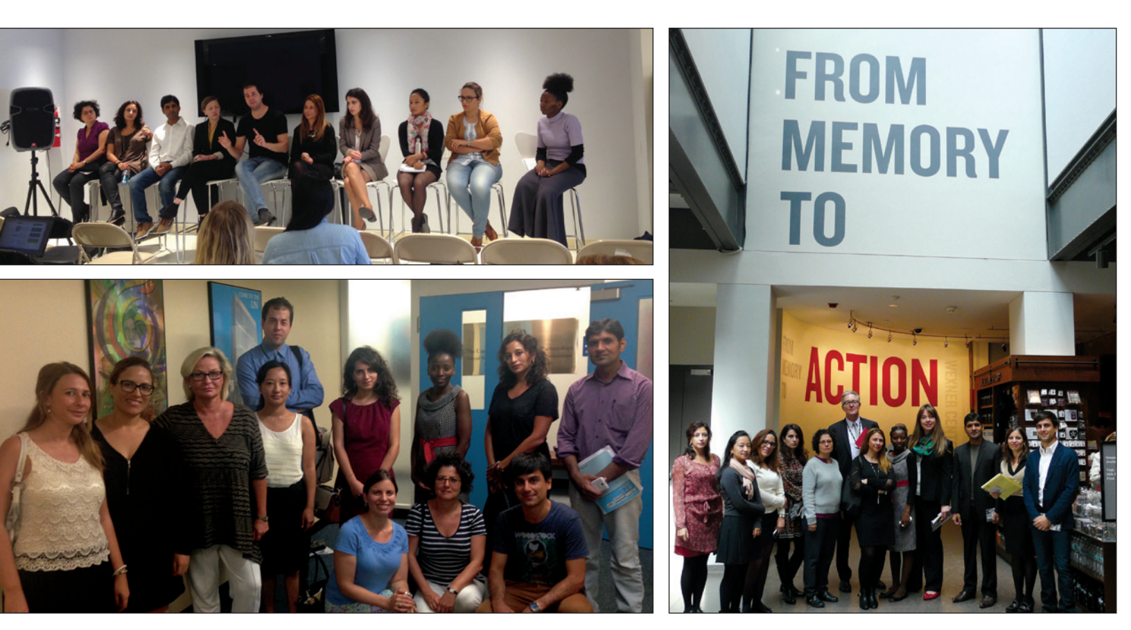
(Top Left) Discussion and meeting at Clinton Global Initiatives (Right) Tour and workshop at the United States Holocaust Memorial Museum in Washington, D.C. (Bottom Left) The AHDA fellows at UNDEF.

historical dialogue treats the past as a factor of conflict that must be addressed if a better future is to be created. In addition, historical dialogue focuses on the communal memories of conflict —memories that often pre-date living individuals. Although recognizing the importance of holding individuals accountable, historical dialogue does not focus on legal justice or retributive policies, but rather on engaging opposing sides of the conflict, acknowledging responsibility and guilt in their various manifestations, acknowledging and leveraging the central role of history in understanding conflict, and exploring restorative action at the group level (e.g. through museums).